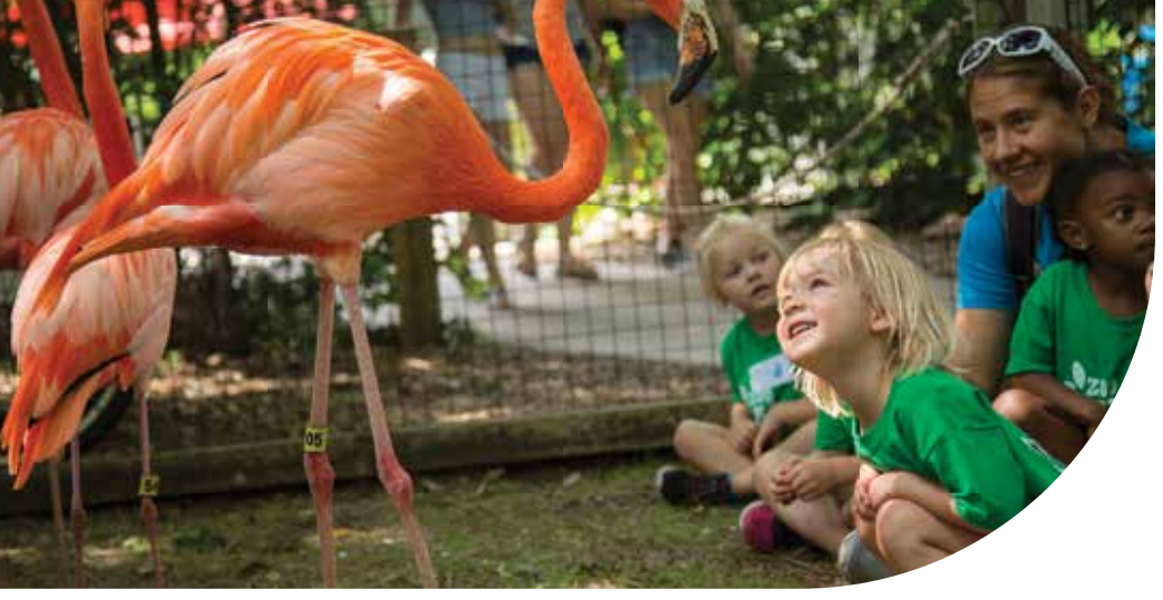
Lincoln Children's Zoo